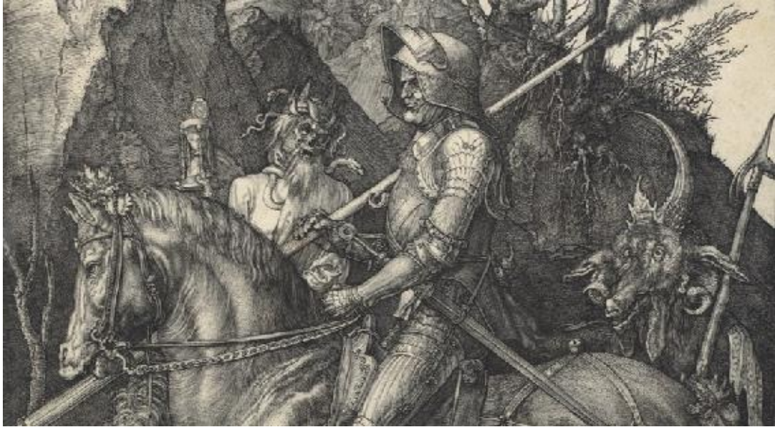
Albrecht Dürer, Knight, Death and the Devil (1513).