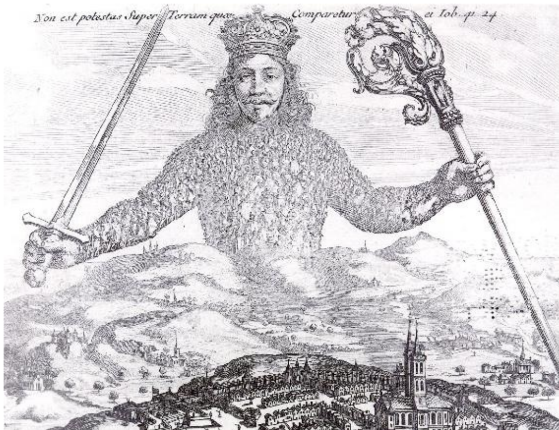
Frontispiece for Thomas Hobbes' Leviathan (1651). Engraving by Abraham Bosse.